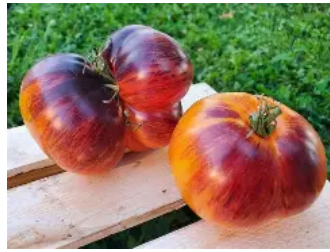
Alice's Dream-Heirloom 80 days 5-14 oz Indeterminate Heirloom