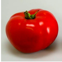
Moskvich 60 days 4-6oz Indeterminate heirloom Trellis Support