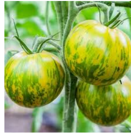
Green Zebra- Heirloom 75 days 3 oz Indeterminate heirloom Trellis Support