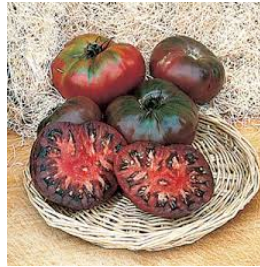
Cherokee Purple 72 days 8-12oz Indeterminate heirloom Trellis Support