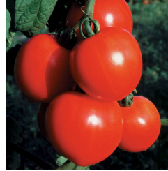
Early Girl 60 days 4-6oz Indeterminate Trellis Support