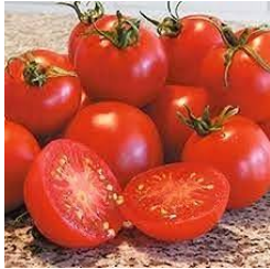
Glacier- Heirloom 55 days 1-2 oz Compact Determinate Container Friendly