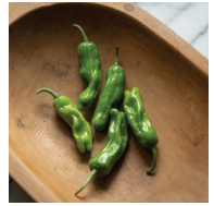
Shishito 60 green, 80 red Small Thin walled, japanese pepper *Occasional spicy kick