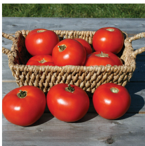
Mountain Fresh Plus 75 days 8-16 oz Determinate Container Friendly