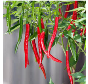
Cayenne 85 days Elongated small hot pepper, red when ripe