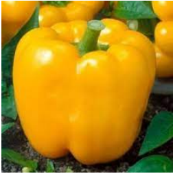
Golden California Wonder 60 green, 80 golden Med-Lg Sweet bell pepper green to yellow