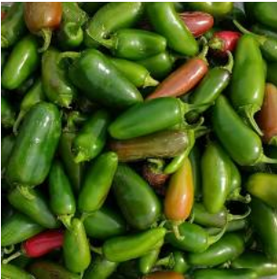
Early Jalapeno 60 green, 80 red 2-2.5" Sm-Med hot pepper