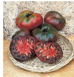
Cherokee Purple 72 days 8-12oz Indeterminate heirloom Trellis Support