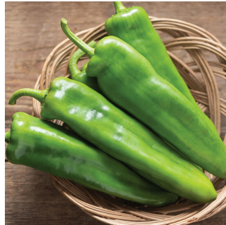
Anaheim 65 green, 85 red 7x3" Medium hot pepper