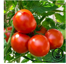
Oregon Spring 60 days 6-7oz Compact Determinate Container Friendly