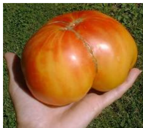
Striped German- Heirloom 78 days Up to 12 oz Indeterminate Heirloom Trellis Support