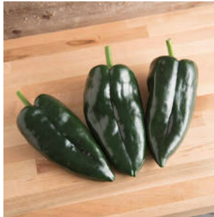
Poblano 65 green, 80 Red 5x3" Great for stuffing or roasting