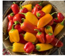
Lunchbox Peppers 55-63 green, 75-83 color Small Mini orange, red, and yellow peppers