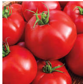
Big Beef 70 days 10-12 oz Indeterminate Trellis Support