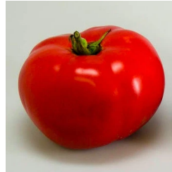
Moskvich 60 days 4-6oz Indeterminate heirloom Trellis Support