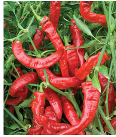
Jimmy Nardello 75 Red Med-Lg Sweet long Italian Pepper