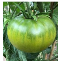
Aunt Ruby's German Green- Heirloom 85 days 8-16oz Indeterminate Heirloom Trellis Support