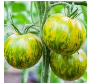
Green Zebra- Heirloom 75 days 3 oz Indeterminate heirloom Trellis Support