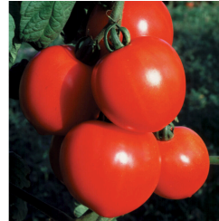
New Girl 60 days 4-6oz Indeterminate Trellis Support