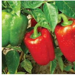
Red California Wonder 65 green, 85 red Med-Lg Sweet bell pepper green to red